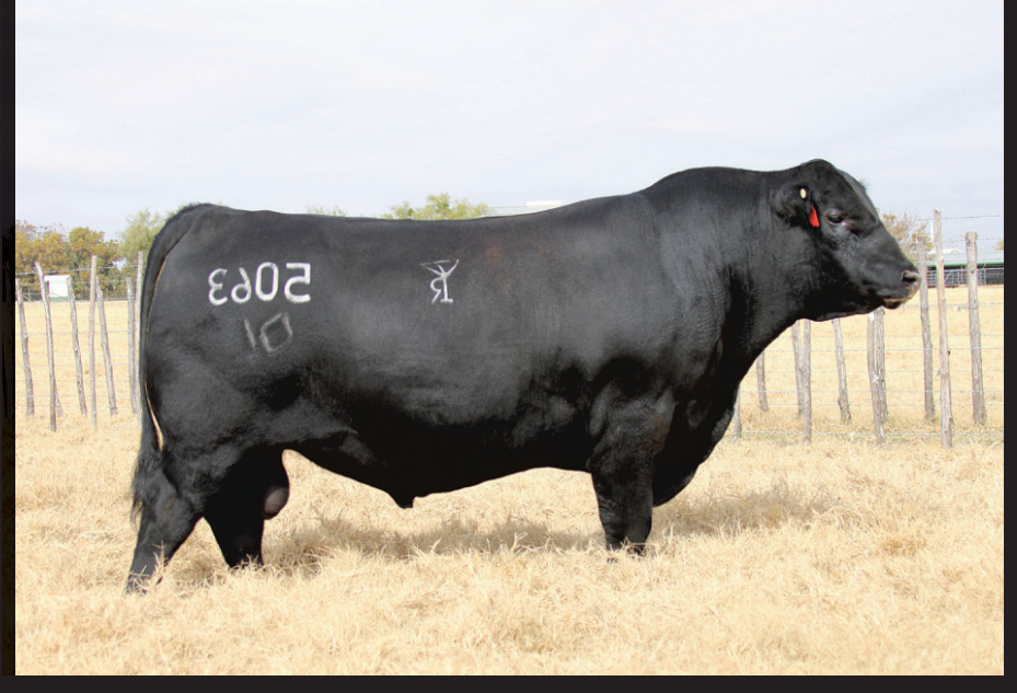
Bar R Jet Black - First sons selling in Australia

具機器具 CONTACT US TO RECEIVE A COPY SCAN QR CODE TO VIEW ONLINE